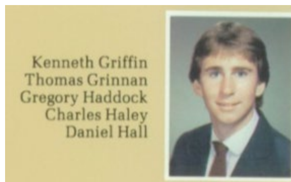
1986 - Senior year of high school