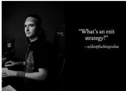
Bet he's got a few shares in the pool...