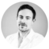
Ryan Cohen ✓ @ryancohen