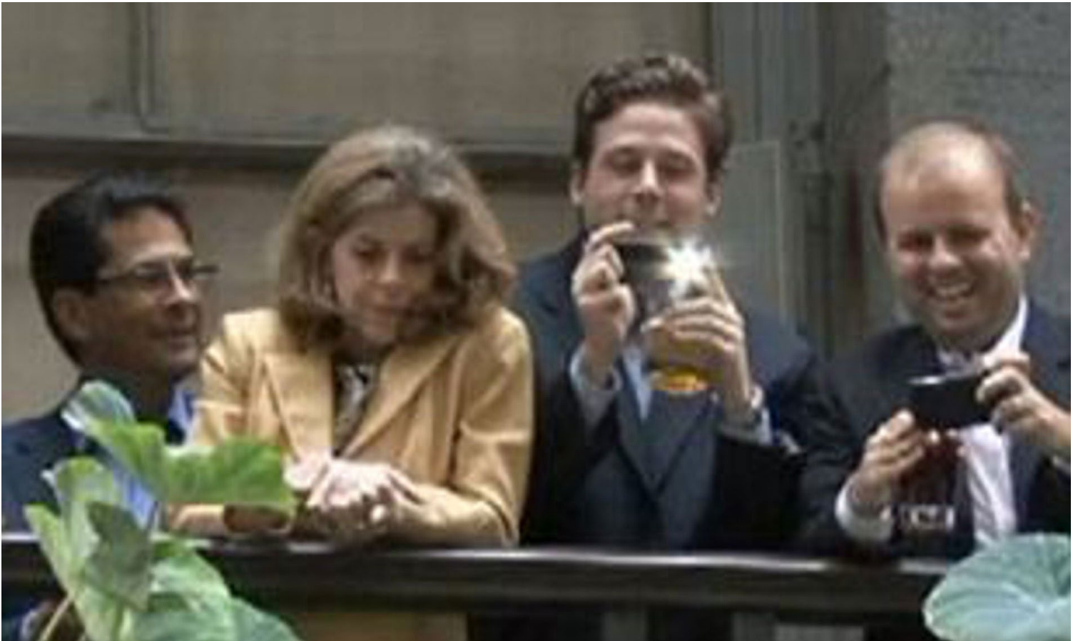
Taken during the 2011 Occupy Wallstreet March (At National i